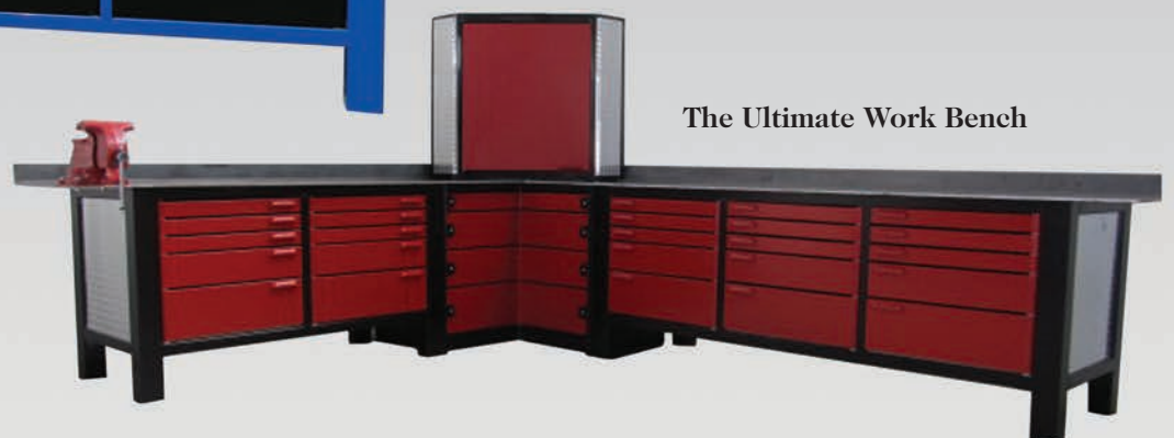
The Ultimate Work Bench